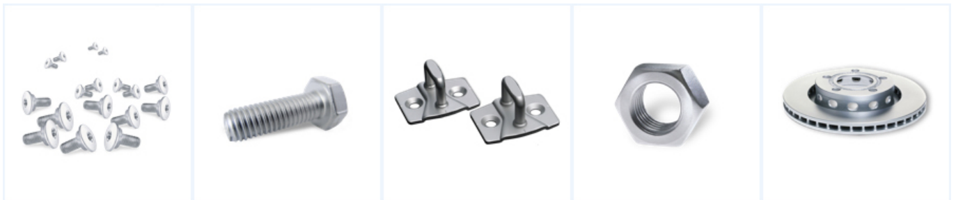
Metrical threaded bolts M2-M16